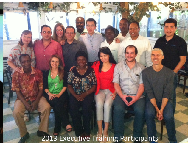
2013 Executive Training Participants

"I came for the content, and I thought it was very rich...[it brought] together all of those issues that have been taken compartmentally in the past to show a holistic picture of extractive industries."