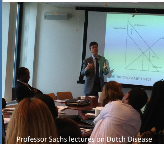
Professor Sachs lectures on Dutch Disease

We look forward to welcoming you in June!